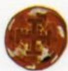
LAPEL BUTTON OR PIN