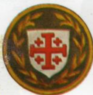
KNIGHT OF THE GRAND CROSS