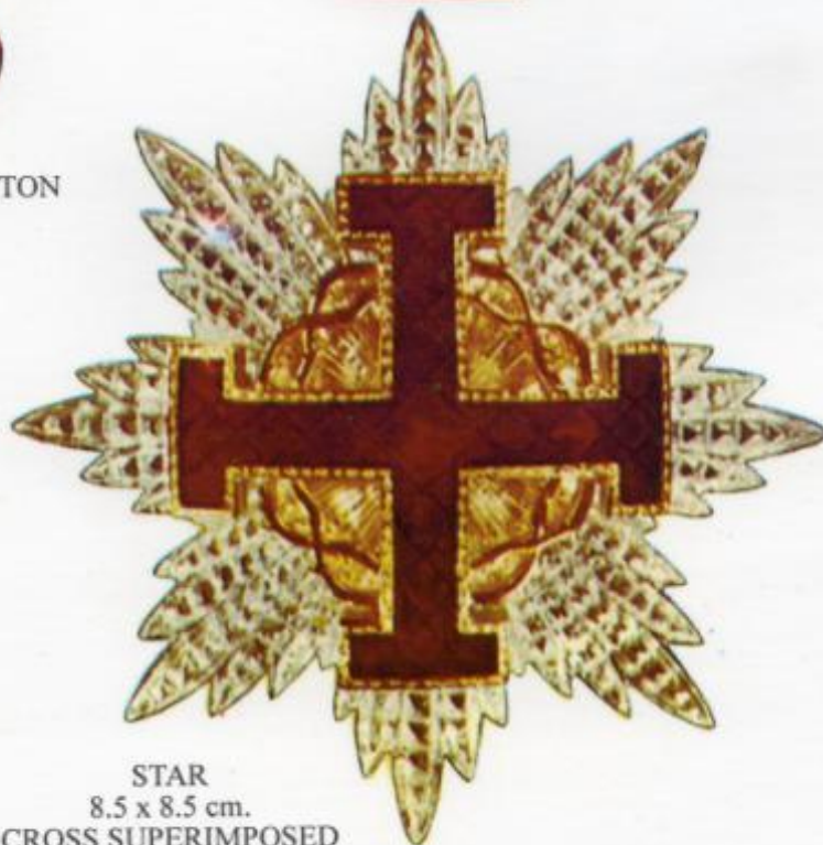
STAR 8.5 x 8.5 cm. CROSS SUPERIMPOSED 5.2 x 5.2 cm.