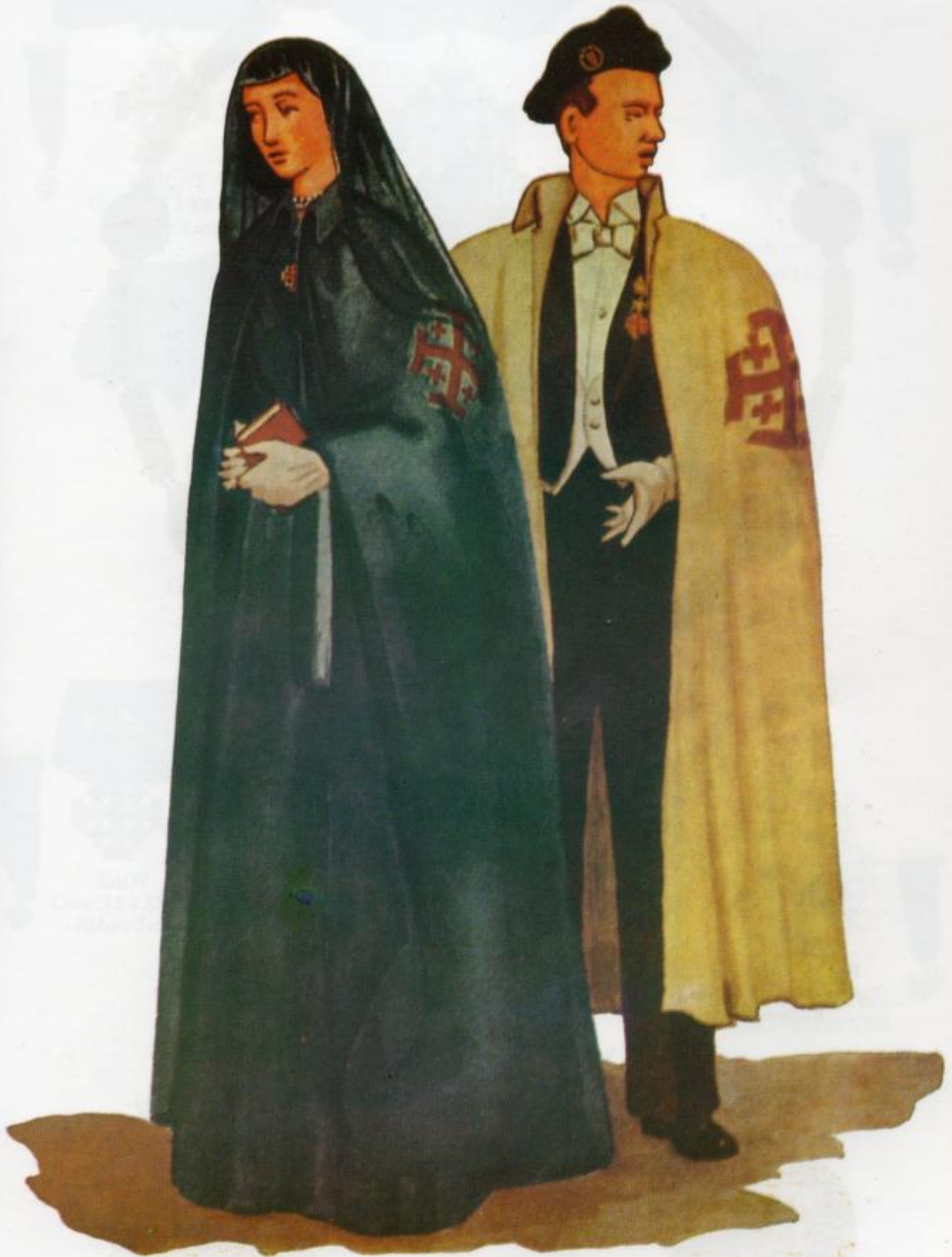
LADY WITH CAPE