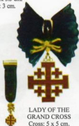
LADY OF THE GRAND CROSS Cross: 5 x 5 cm. Sash: 10 cm.