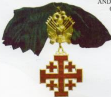
KNIGHT OF THE GRAND CROSS Cross: 5 x 5 cm. Sash: 10 cm.