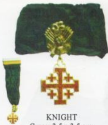
KNIGHT Cross: 3.5 x 3.5 cm. Ribbon: 4 cm.