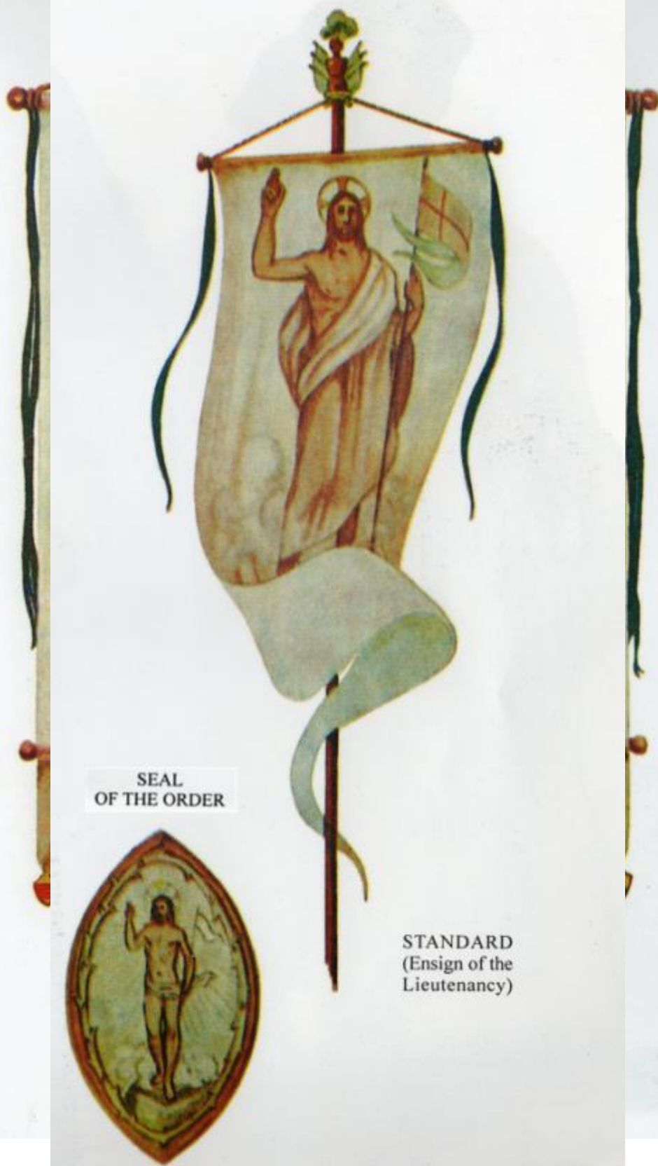
SEAL OF THE ORDER