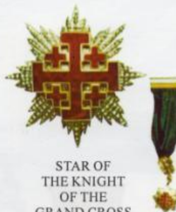
STAR OF THE KNIGHT OF THE GRAND CROSS 8.5 x 8.5 cm.