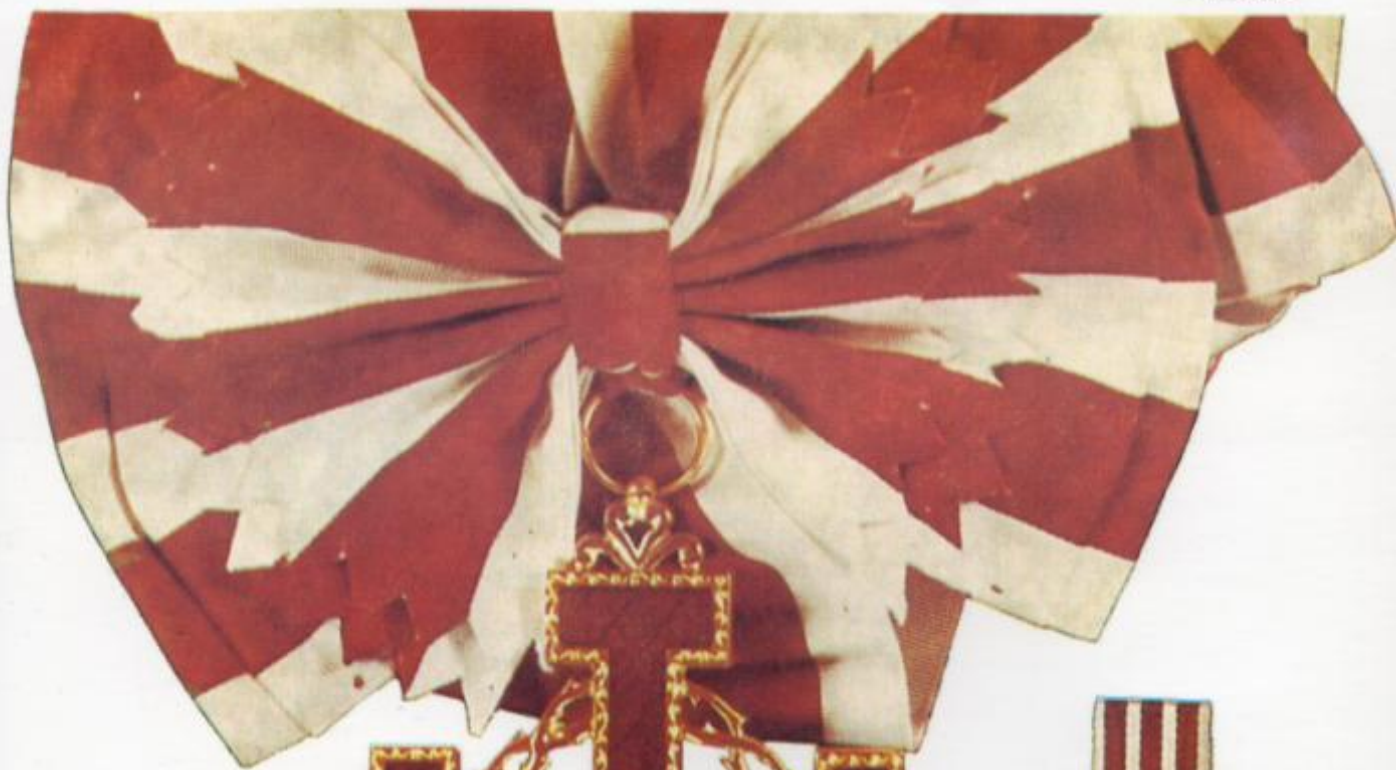
CROSS WITH GOLD STAR OF MERIT OF THE HOLY SEPULCHRE OF JERUSALEM Cross: 6.4 x 6.4 cm. Sash: 10 cm.