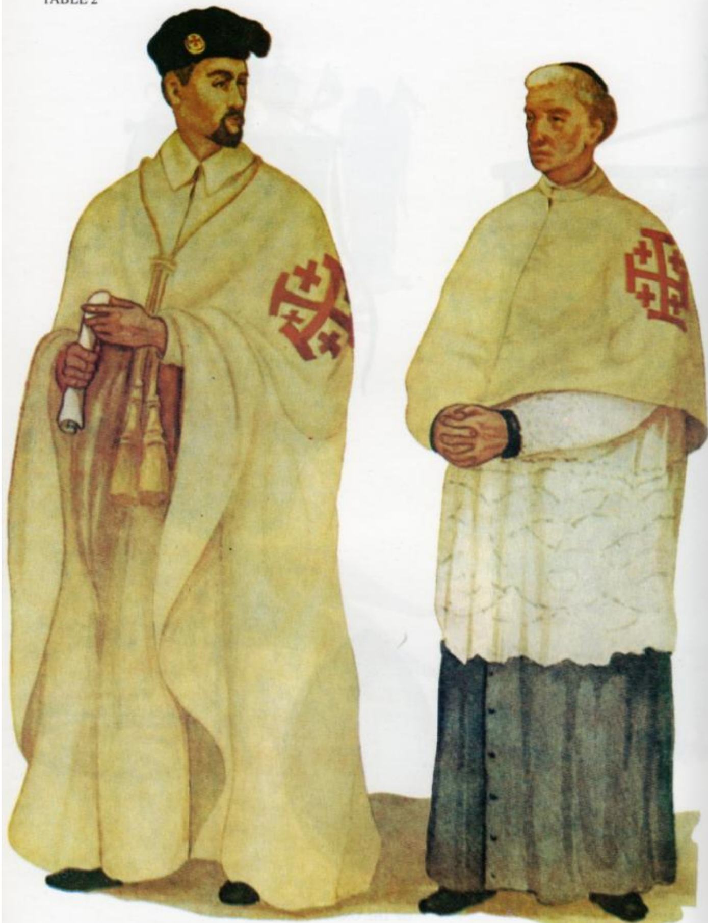
DIGNITARY OF THE ORDER WITH CAPITULAR CAPE