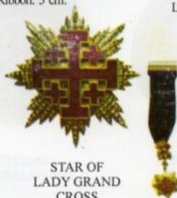
STAR OF LADY GRAND CROSS 8.5 x 8.5 cm.