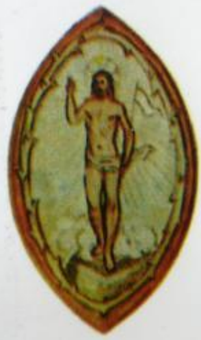
SEAL OF THE ORDER