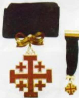
LADY COMMANDER Cross: 5 x 5 cm. Ribbon: 5 cm.