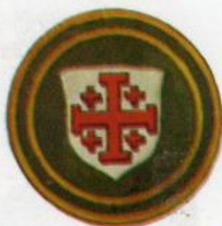
COMMANDER WITH STAR