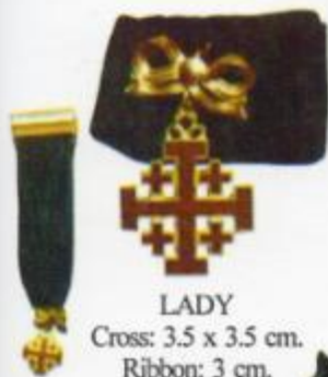
LADY Cross: 3.5 x 3.5 cm. Ribbon: 3 cm.