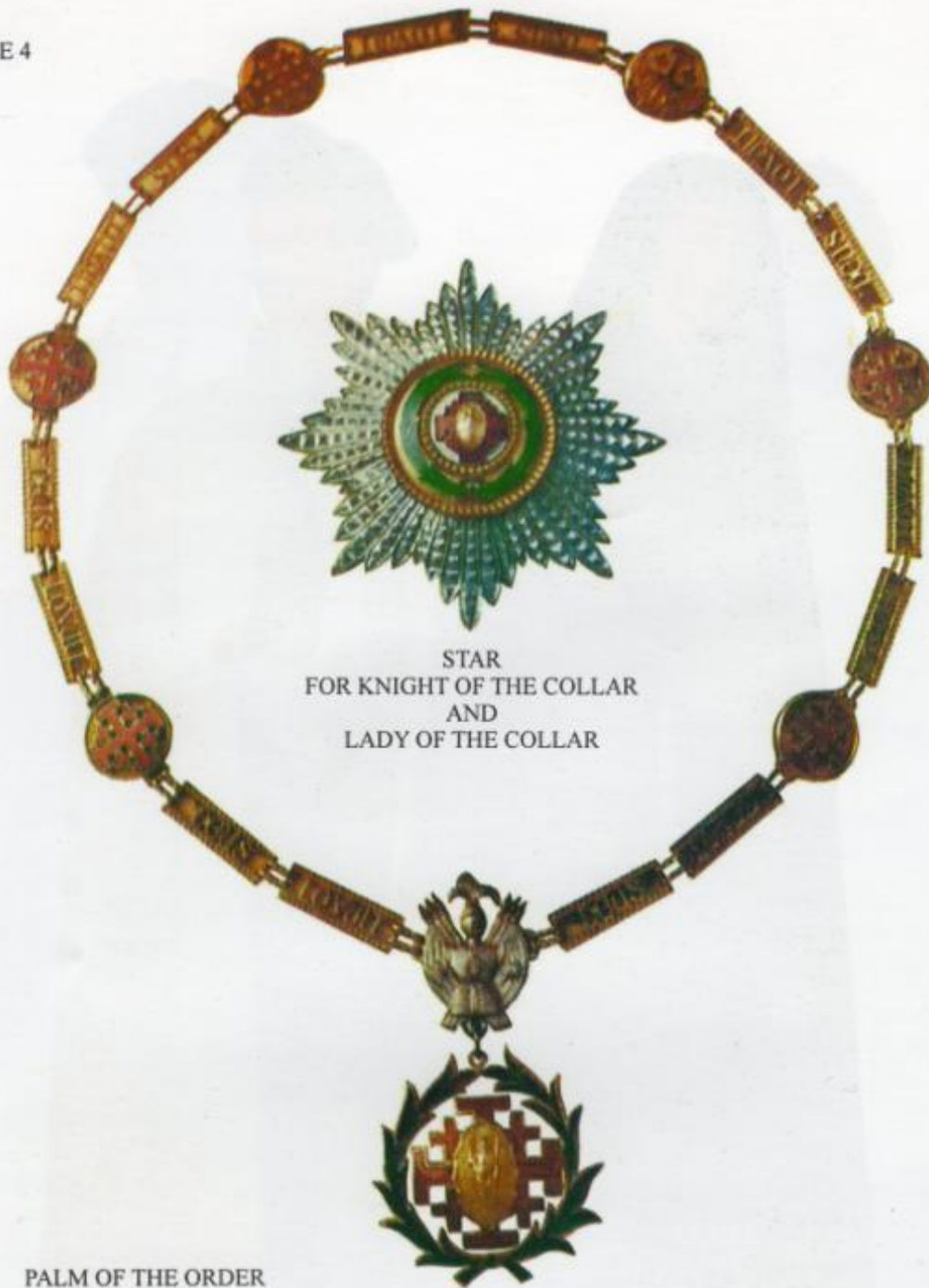
STAR FOR KNIGHT OF THE COLLAR AND LADY OF THE COLLAR