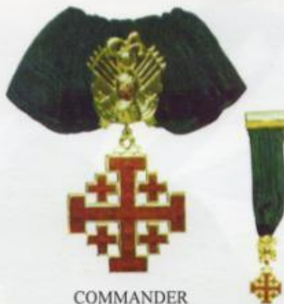
COMMANDER AND GRAND OFFICER Cross: 5 x 5 cm. Ribbon: 5 cm.