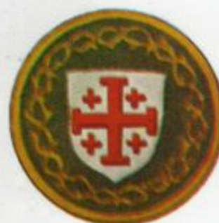
KNIGHT OF THE COLLAR