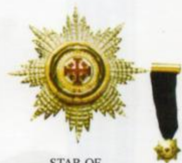
STAR OF LADY GRAND OFFICER