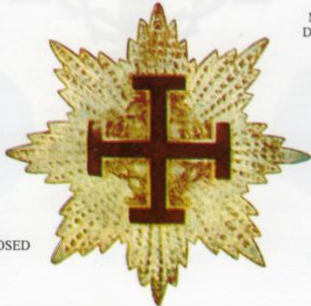
STAR 7.2 x 7.2 cm. CROSS SUPERIMPOSED 3.5 x 3.5 cm.